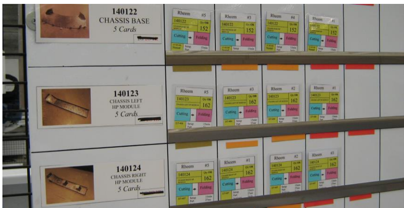
Kanban Board at Sheetmetal Fabrication Company

Your team will learn why Kanban is so important – in fact, Toyota consider Kanban the crown jewel of the Toyota Production System. They will learn the history of 'Just-in-Time', how to build customer-supplier relationships, Kanban calculations, and how to create their own Kanban system.