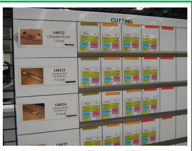
Kanban Board at Sheetmetal Fabricator