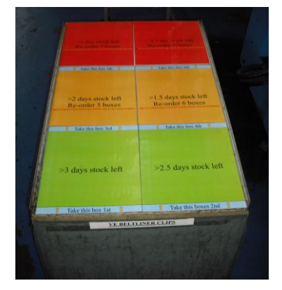
Pull System at Auto Parts Supplier