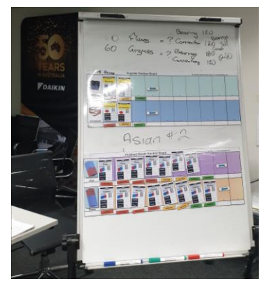
Kanban Workshop at HVAC Manufacturer