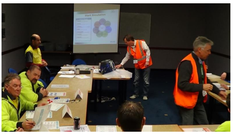
Kanban Simulation for Sheetmetal Fabricator