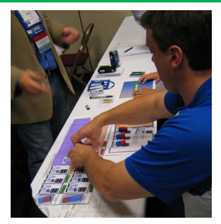
'Kanban Workshop' Conference Delivery

The outcomes and results to expect from the 'The Plug Factory – Lean Fundamentals' will be agreed with your management team, and our workshop will be customized to meet your goals. To give you some insights and what can be achieved, some ideas include: