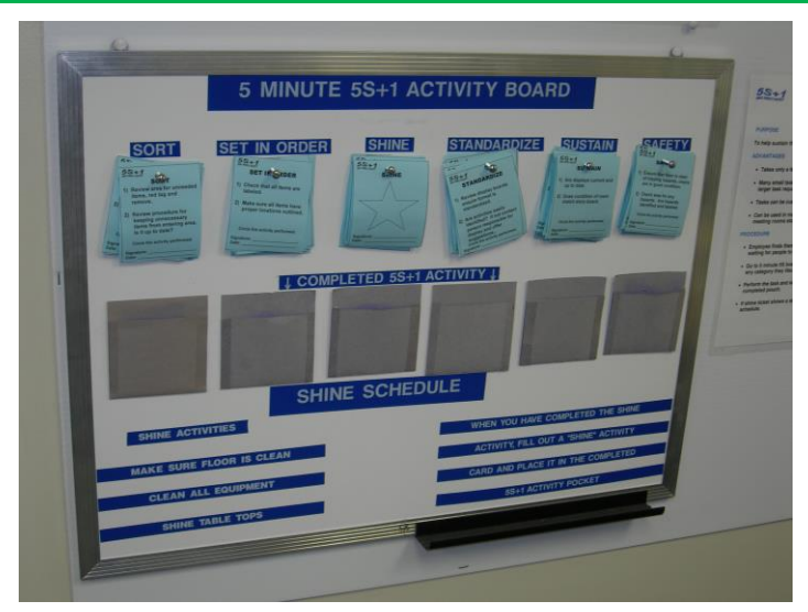
5S 5-Minute Activity Board