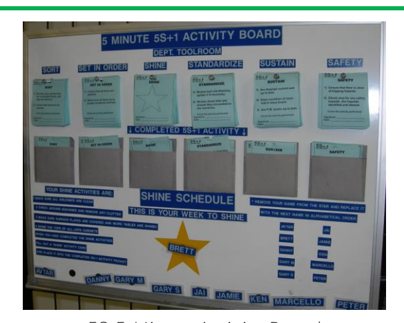
5S 5-Minute Activity Board