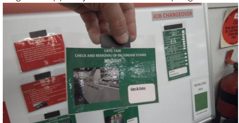
'Clean As You Go' Board at Packaging Company

More than just a Sort-Set-Shine workshop we will introduce a 5S-6S methodology that really works to support HAACP (Hazard Analysis Critical Control Points, GMP (Good Manufacturing Practices) and Cultural Change to support your accreditation programs.