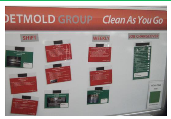
'Clean As You Go' Board

The outcomes and results to expect from the '5S-6S Workshop' will be agreed with your management team, and our workshop will be customized to meet your goals. To give you some insights and what can be achieved, some ideas include: