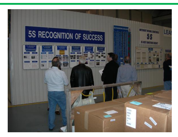
5S Around the Works