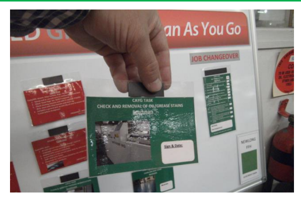
'Clean As You Go' Detail